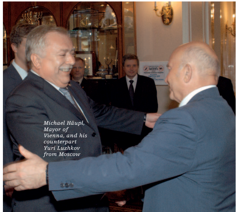
Michael Häupl, Mayor of Vienna, and his counterpart Yuri Luzhkov from Moscow

All of the above activities are to instil a sense of friendly neighbourhood in a Europe we will all be sharing. Vienna wants to play an active part in shaping this "Future Project" of ours alongside its European neighbouring cities.